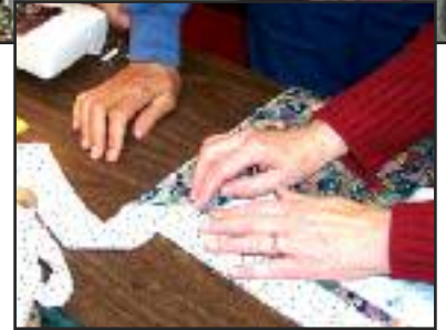
Getting help with mitering a corner on the binding.