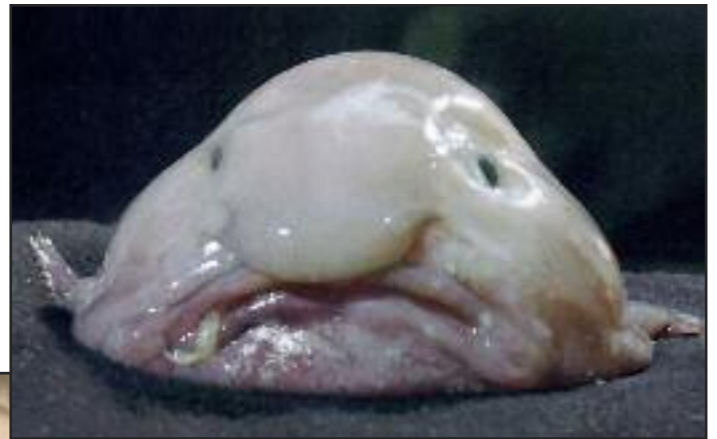
Above and left: Blobfish

Surprisingly, the sea creatures are still very much alive and well in Lake Huron's (to them at least) very shallow and warm fresh water. "Some of these