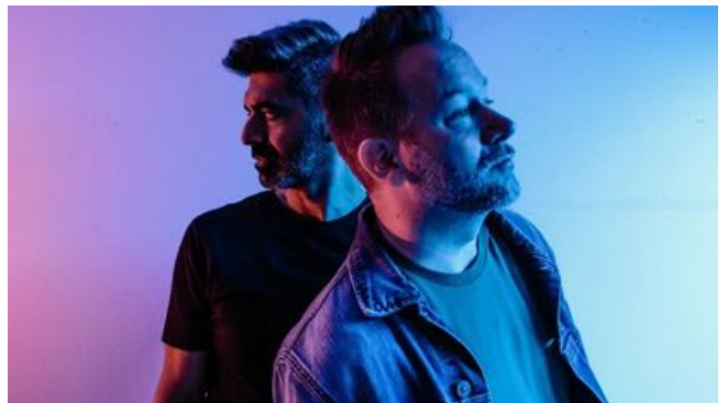
Wide Mouth Mason

And finally, Go North's 2026 Headliner is... Juno award winning legendary Canadian East Coast rockers Wintersleep! They're touring with music from their new album "Wishing Moon" released in March 2026, and playing your favourites like "Weighty Ghost" and "Amerika".